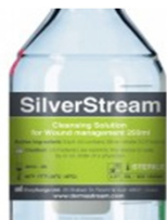
Fig. 1 SilverStream is currently available as a wound irrigant. It can also be used as part of a daily dressing protocol.

SilverStream, by EnzySurge, Ltd., Israel, was cleared by the FDA in 2009 for the treatment of a variety of wounds including Diabetic foot ulcers, Venous leg ulcers, and other types of difficult, non-progressive wounds.