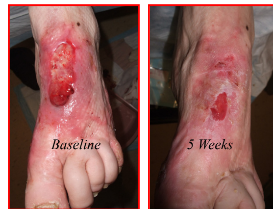
FIG. 4: The initial wound is covered with approximately 60% fibrous tissue, more proximally. After 5 weeks treatment with SilverStream, the wound shows a granular base, and no fibrotic or non-viable tissue.

Following treatment, 100% of the cases showed complete resolution of any signs of infection. Another critical element was the ability of SilverStream to aid in the development of granulation tissue, along with the removal of non-viable (necrotic or fibrous) areas. Overall, there was an average increase of 19% coverage in surface area with granulation tissue, and an average reduction of 9.4% of the wound area covered with fibrous and non-viable tissue. A typical clinical example of the development of granulation tissue and reduction in fibrous material can be seen in figure 4.